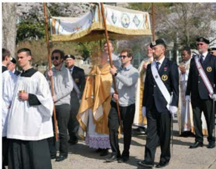
College Knights carry the canopy over the Blessed Sacrament and Fourth Degree Knights provide an honor guard as Bishop Edward Rice leads a Eucharistic procession through Cape Girardeau, Mo., March 17. It was the final day of an 845-mile Eucharistic pilgrimage across the Diocese of Springfield-Cape Girardeau.

The Anima Christi pilgrimage is but one of the numerous ways K of C councils across the United States have promoted Eucharistic devotion since the U.S. bishops launched the National Eucharistic Revival in June 2022. As the National Eucharistic Pilgrimage makes its way to Indianapolis for the National Eucharistic Congress in July, Knights of Columbus continue to take up the call, emphasized by Supreme Knight Patrick Kelly during his installation in 2021, to be "Knights of the Eucharist."